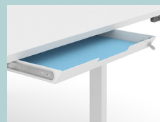
Felt-lined metal drawer with lock