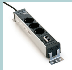
Power socket blocks