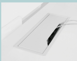
Metal grommet: 317x119, H=27 mm